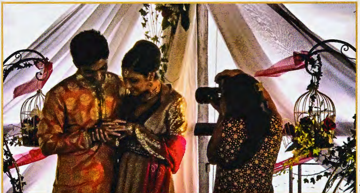
The models enact a traditional Indian engagement ring ceremony. The finalists photographed the couple in nine different shooting sessions, each with a different theme, across six days, in Malaysia.

A second part of the face-off involved the finalists creating an aesthetically pleasing photo album using the images they made during the face-off.